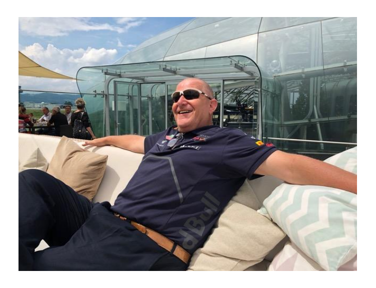
Now wonder Red Bull gives you Wings !!.

Now the challenging part driving the Stelvio Pass and the equally hard SP29/42 from Bormio to Dimaro. Top Gear voted this the best driving road in the world in 2008 and with it 48 switchback turns climbing to a height of 2,757m it certainly is a dramatic mountain road, that must surely be on every petrol heads list of roads to drive.